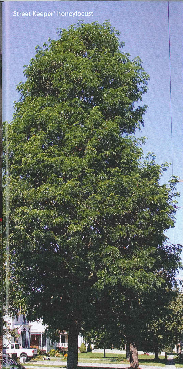
Street Keeper® honeylocust