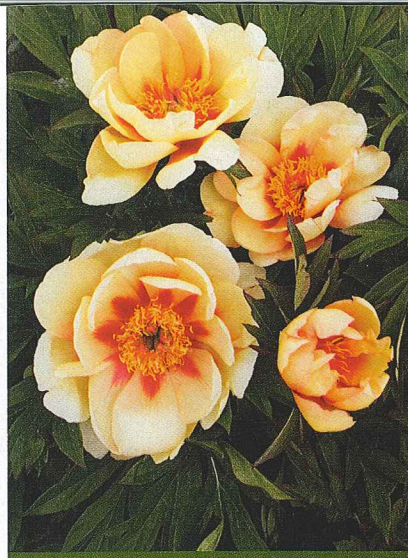
Left: Misaka™ Itoh Peony has 8-inch diameter flowers that appear orange when first opening — rare among intersectional hybrids. Below: 'Viking' bellflower. Bottom: Weeping Extraordinaire™. Opposite page, top: Icy Drift®. Bottom: Little Lime™ hydrangea.