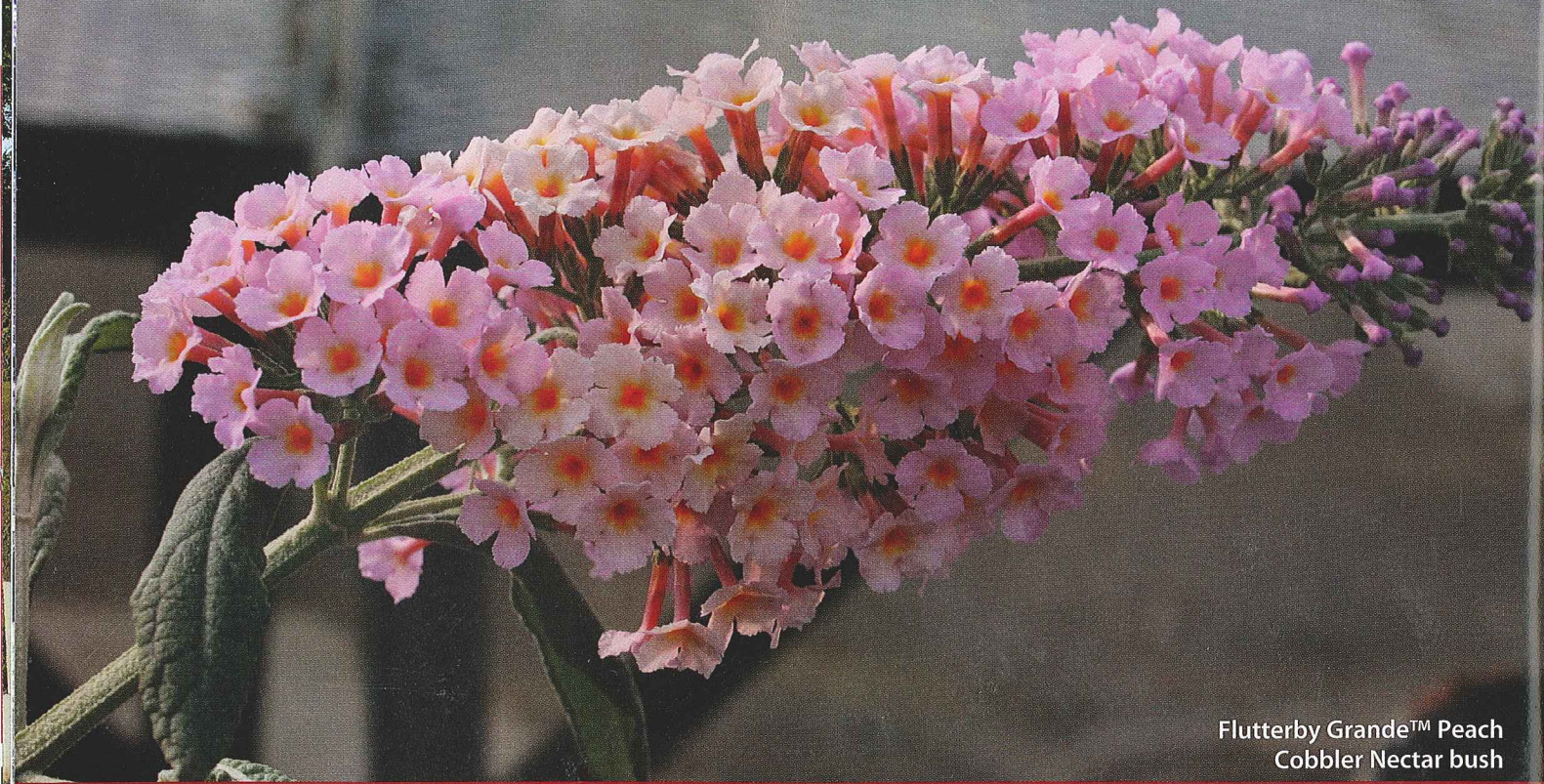
Flutterby Grande™ Peach Cobbler Nectar bush