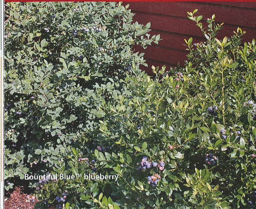
Bountiful Blue™ blueberry