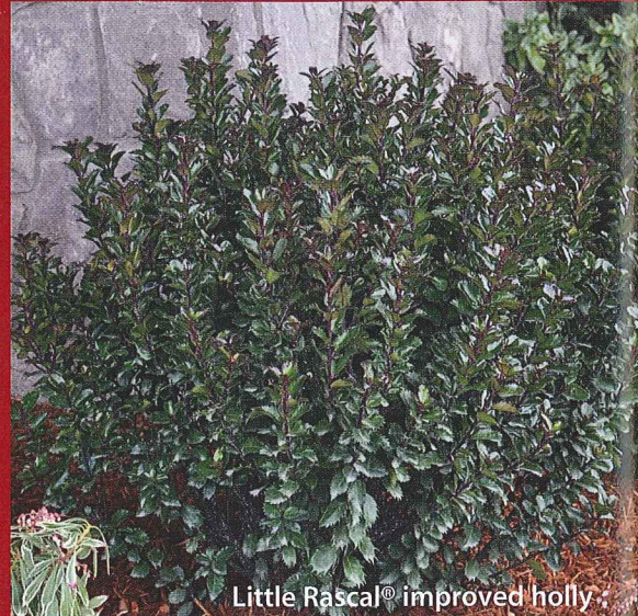
Little Rascal® improved holly