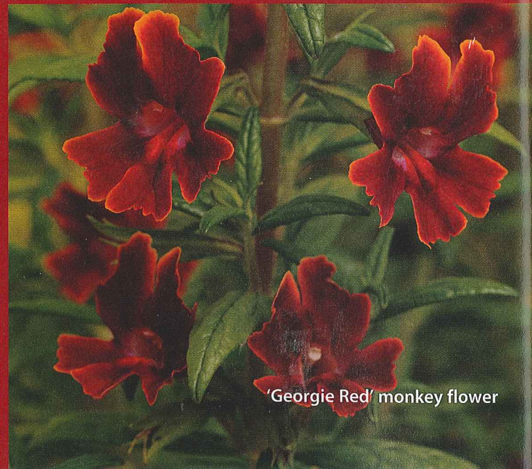
'Georgie Red' monkey flower